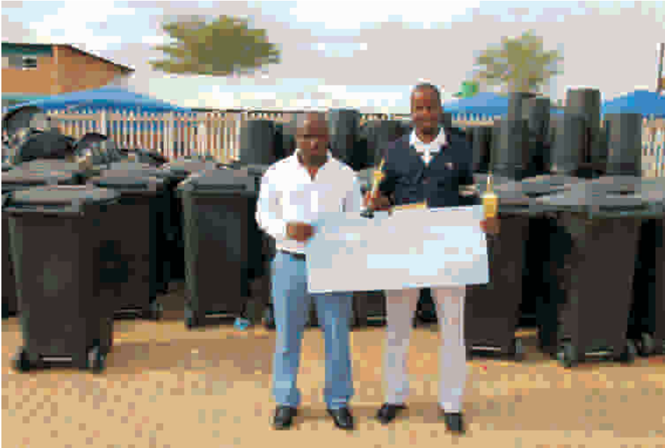
Officials with R10 000 cheque and trophies for 3rd runner up and moderate archiver awards.

F etakgomo Municipality is a participant in the Greenest Municipality Competition (GMC). The GMC is an annual national programme for local municipalities in South Africa. The competition was initiated as Cleanest Town Competition 2001. The Primary focus of this competition was to implement the National Waste Strategy, however with time the concept was modified to embody other elements that are outside the waste management strategy. GMC consists of the following core elements, namely: Waste Management; Energy Efficiency and Conservation; Water Management; Landscaping, tree planting and beautification; Public Participation and Community Empowerment and Leadership and