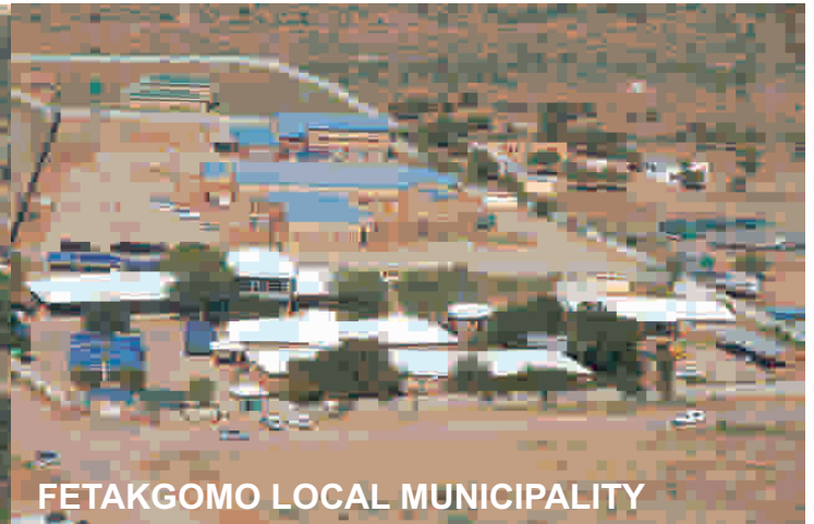
FETAKGOMO LOCAL MUNICIPALITY

It is trite that the Municipal Demarcation Board (MDB) has concluded its re-determination of the municipal boundaries for 2016 Local Government Elections in terms of which the Fetakgomo/Greater Tubatse Municipalities are on the brink of amalgamation to form a new municipality.