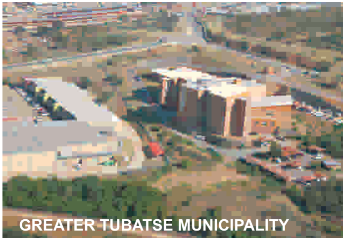
GREATER TUBATSE MUNICIPALITY