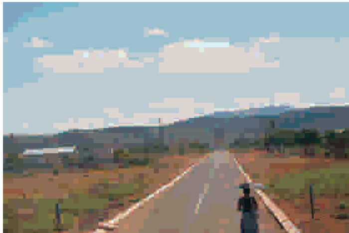
Completion of Hoeraroep Portion 2-Sports Complex Internal Street

We are among few municipalities in the province that are able to spend the MIG. To this effect, we received an additional MIG allocation of R15 million as at 31 st March 2016. This additional allocation implies an exponential increase of our total MIG allocation from R22, 109, 000 to