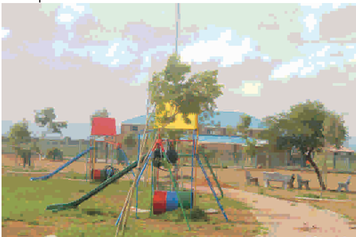
Apel Recreation Park

over 37 million. As part of implementing forward planning, it is envisaged that the MIS registration of all new 2016/17 projects as well as appointments of contractors would be complete on or before 30 th June 2016. We have thus far been able to perfect forward planning.