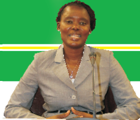
Mayor Kukie Raesejja Sefala