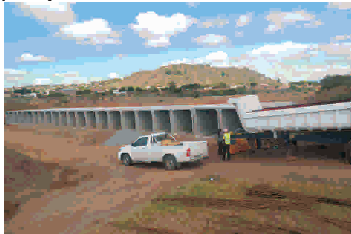
Construction of Nchabeleng Access bridge and Culvert Drainage Structure

over 37 million. As part of implementing forward planning, it is envisaged that the MIS registration of all new 2016/17 projects as well as appointments of contractors would be complete on or before 30 th June 2016. We have thus far been able to perfect forward planning.