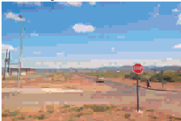
Construction of Traffic Testing Station Route